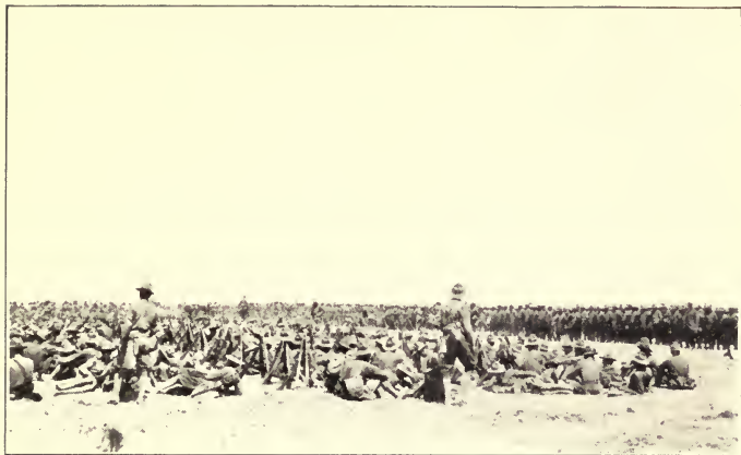
THE SEA OF MEN